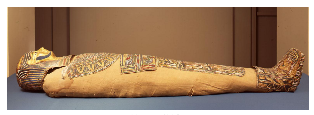
Mummy of Male Egyptian 167-30 BCE Linen, painted cartonnage, remains Carlos Museum, Emory University 1921.6