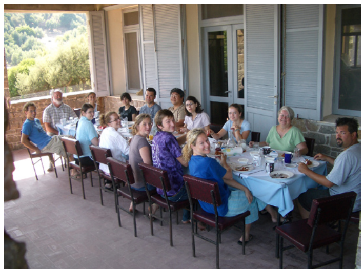
Our Sunday free day finds us at the beach, the waterfall, a café, or on the veranda, but it always starts with a leisurely breakfast.