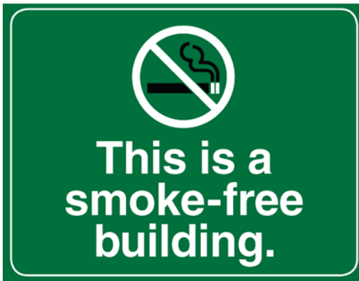
Sample sign from www.smokefreehousingny.org

Consider what assistance you can provide to PHAs and building managers. Providing technical assistance to PHAs and building managers can give them needed direction and confidence with moving forward on their policy. Can you help coordinate a meeting or give a presentation for PHA staff and building managers about preparing for implementation? Can you host a webinar about implementation and enforcement? Can you make smokefree signs available? Can you help managers conduct a survey of residents? Can you connect PHAs with cessation options for their residents?