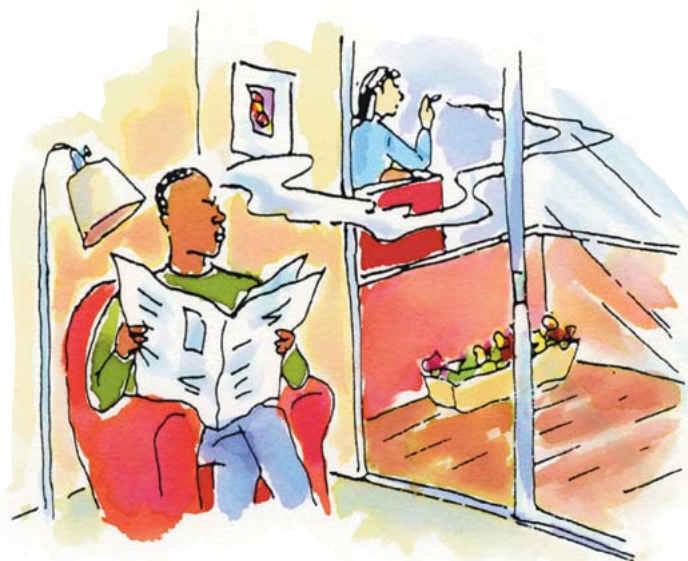
Illustrations by Janet Cleland © California Department of Public Health

As a general rule, it is unwise to file a lawsuit unless you have suffered significant harm. Your chance of convincing a court that you have a justifiable legal claim is far better if you can show that you have been harmed badly by repeated, unwanted exposure to secondhand smoke in your apartment—for instance, if you have visited a doctor with frequent respiratory complaints, missed work due to illness caused by the smoke, stayed away from