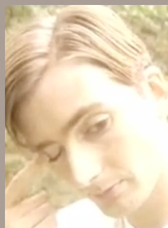
Measure for Measure